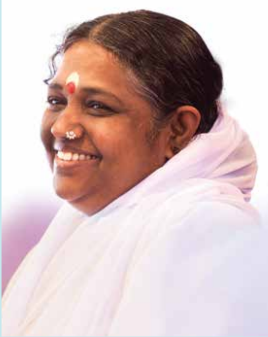
Sri Mata Amritanandamayi Devi

There are two types of Education Education for Living. Education for Life.