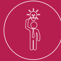
Business Development Trainee