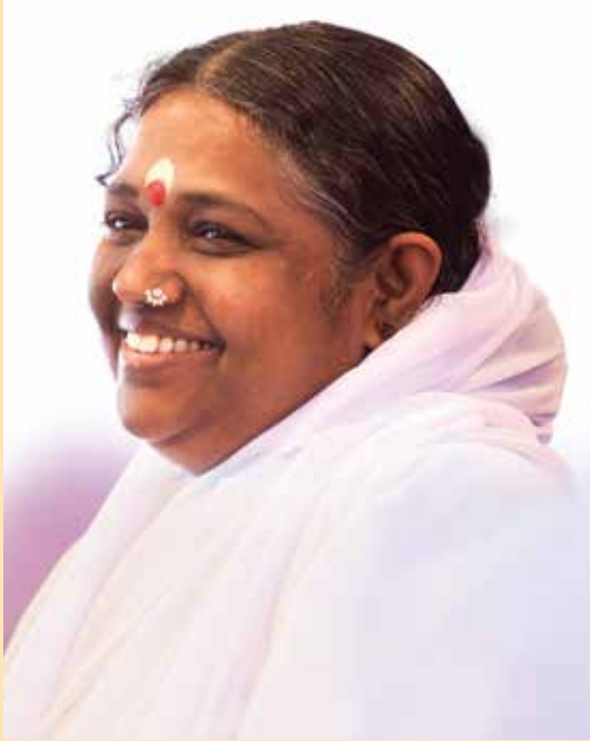
Sri Mata Amritanandamayi Devi

There are two types of Education Education for Living. Education for Life.