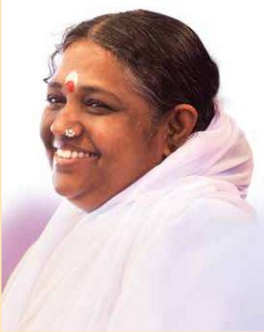
Sri Mata Amritanandamayi Devi

There are two types of Education Education for Living. Education for Life.